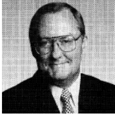
James R. Thompson

Principal Occupation: Chairman, Chairman of the Executive Committee and Partner of the Law Firm of Winston & Strawn, Chicago, Illinois